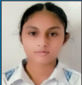
Yeshmeen RGNLU, Patiala 2024